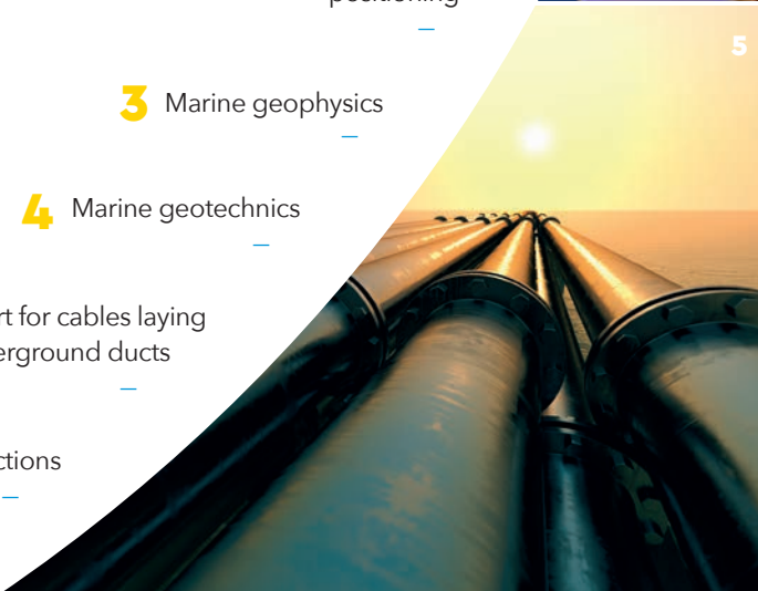
6 Underwater inspections